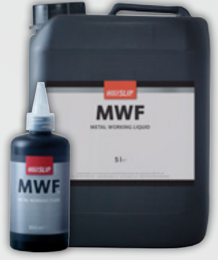
MWF 350ml bottle - 41003 5L pail - 41050

They are suitable for most drilling, reaming and tapping (spiral point, spiral flute and fluteless) operations on most metals. For maximum flexibility of use and to accommodate individual preference the products available are: